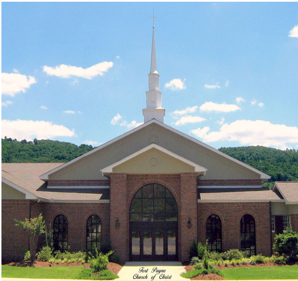
Fort Payne Church of Christ