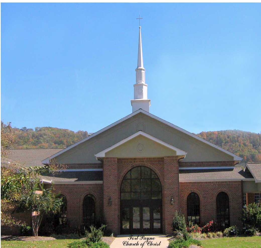
Fort Payne Church of Christ